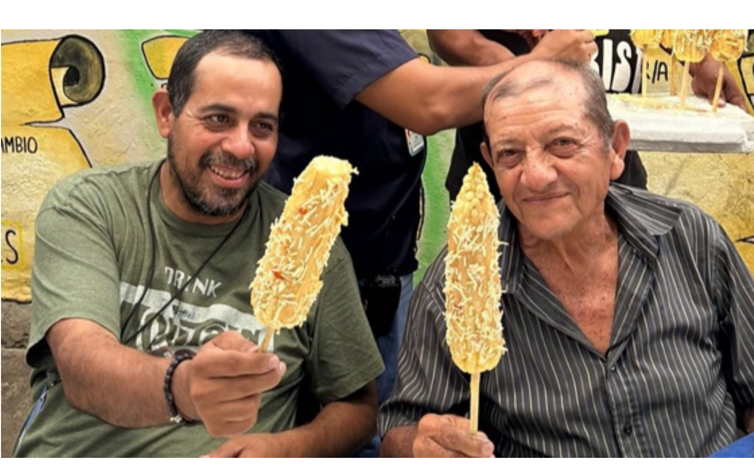
We had a fun time of connection at the Lighthouse Resource Center during our August festival celebration with lots of food, games and activities!